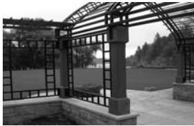
An arbor now serves as a gateway to Willamette River views and new amenities.

George Rogers Park is a 29-acre historic park located near downtown Lake Oswego, at the confluence of the Willamette River and Oswego Creek. The history of the site is integral to the community's origins as a pioneer industrial town, with its prominent location on the river and its rich natural resources. Because of its location, history, and popularity, George Rogers Park is a central part of Lake Oswego's open space system.