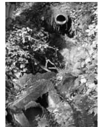
Erosion of the hillside on the site damaged the outfall and is undermining the roadway.

More information about this project will be distributed as it becomes available. The Construction Hotline is updated regularly at 503-635-0261.