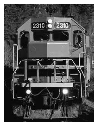
Trains have a long history in Lake Oswego

An engineer can be cited or lose their job if they do not comply with this safety requirement. Although the City has no purview over this issue, it has notified Portland and Western Railroad