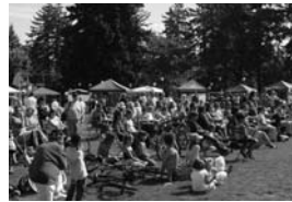
Hundreds gathered at last year's Boones Ferry Days for family-friendly festivities.

Presented by The Lake Grove Neighborhood Association and Lake Oswego Parks and Recreation.