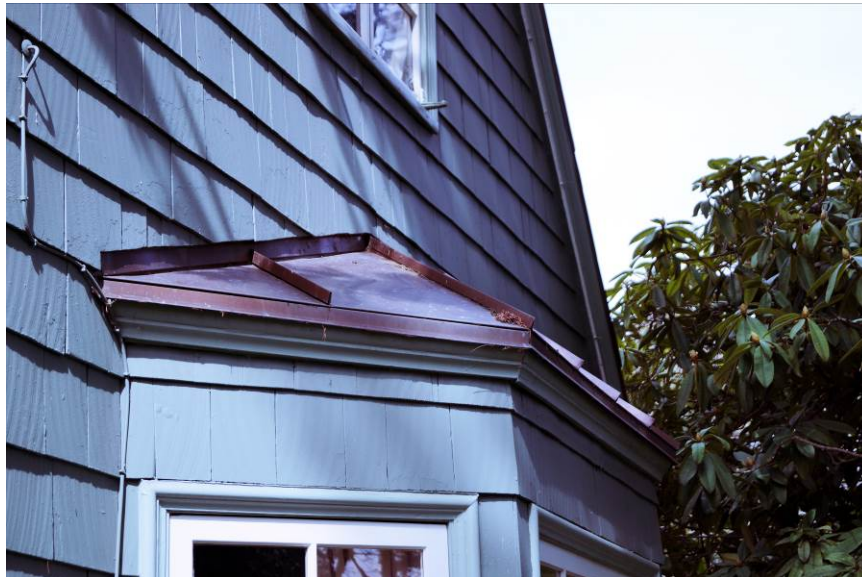
Figure 6. Detail of the copper roof on the east façade. March 2014