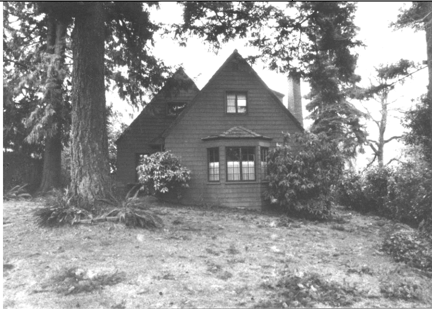
Figure 3. Looking west at the east façade. Date unknown. Photo ID: HRAB257