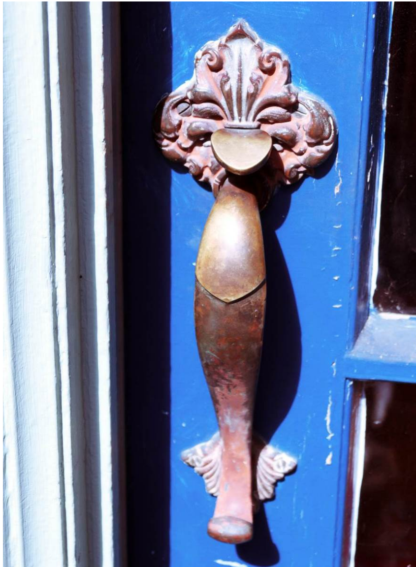
Figure 8. Decorative door handle. March 2014

*Researcher/ Organization: L. Radwanski/E. Heideman/A. Boyd/ SWCA-1220 SW Morrison St, Portland, OR 97205 City of Lake Oswego, 380 "A" Avenue, Lake Oswego, OR 97034 Additional research and review by Erin O'Rourke-Meadors