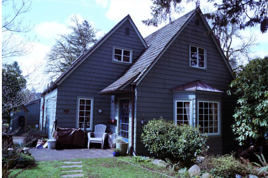
Figure 5. Looking northwest at the south and east façades. March 2014