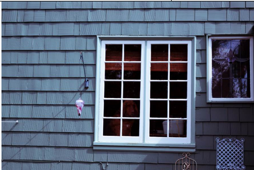
Figure 7. Casement, multilight window detail. March 2014