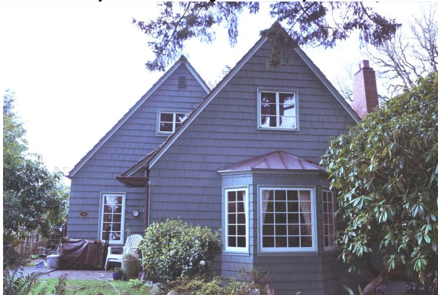
Figure 4. Looking west at the east façade. Date unknown.