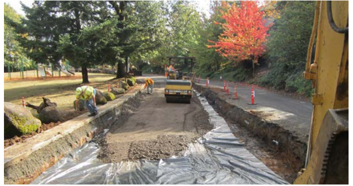
Similar pavement construction