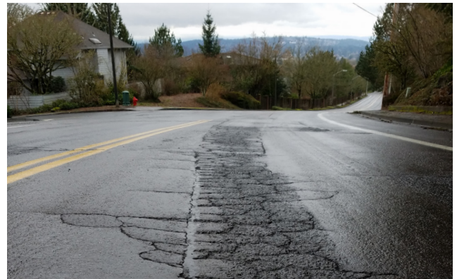
Current pavement conditions on Jefferson Parkway

By the end of summer, neighbors will have nearly a mile of smooth new road, but the process requires your patience. We appreciate all neighbors abiding by traffic control signage and avoiding active construction areas for the safety of all.