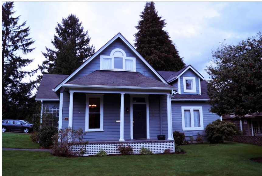
Figure 6. Looking north at the south façade. March 2014.