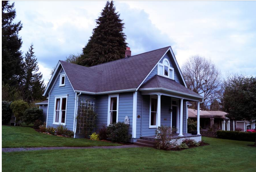
Figure 5. Looking northeast at the west and south façades. March 2014.