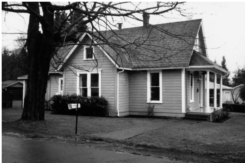
Figure 3. Looking northeast at the west and south façades. Date unknown. Photo ID: HRAB21