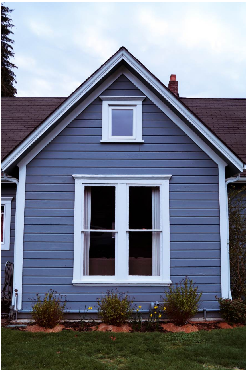
Figure 8. Detail of the west gable projection looking east. March 2014.

Street Address: Situs Address: 357 E Avenue