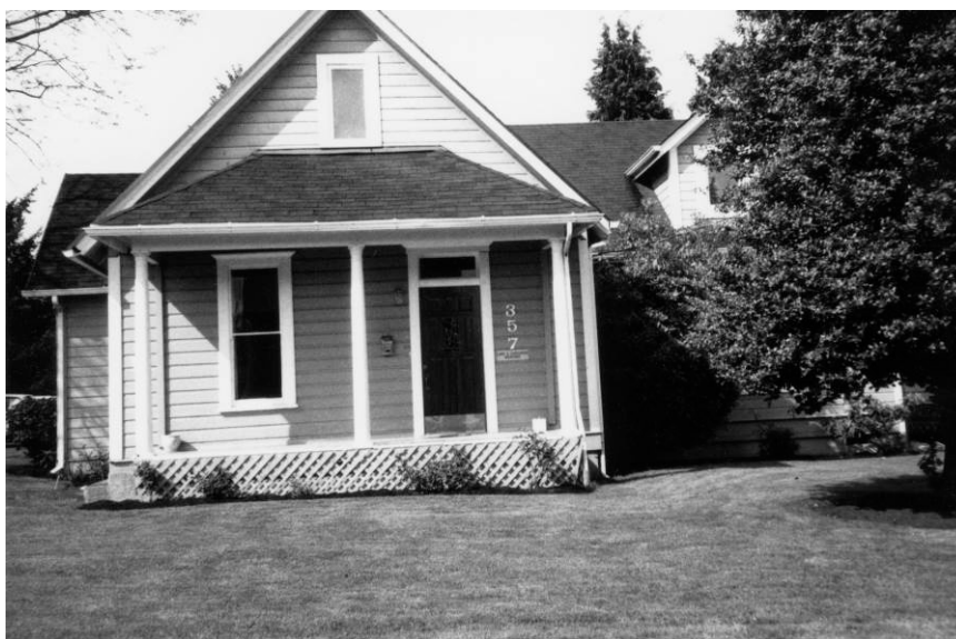
Figure 4. Looking north at the south façade. Date unknown. Photo ID: HRAB22