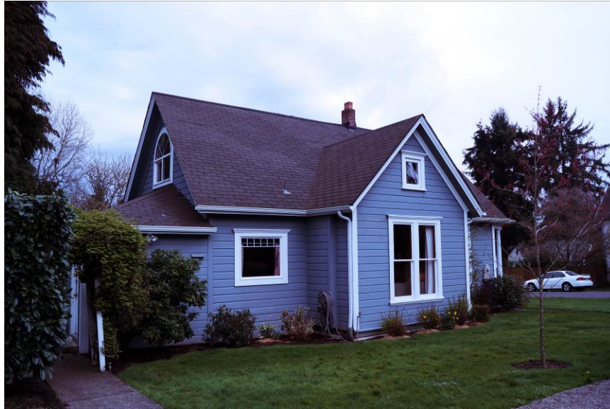
Figure 7. Looking southeast at the west and north façades. March 2014.