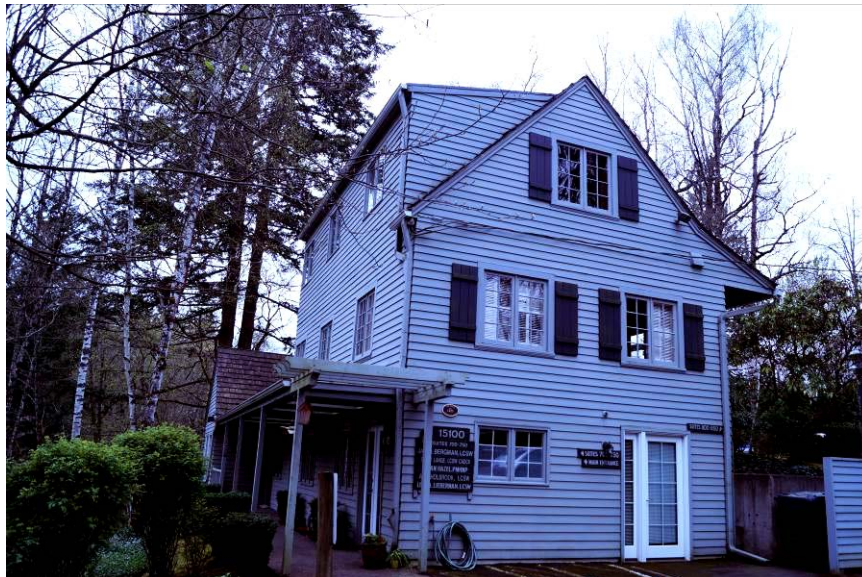
Figure 5: Looking southwest at the north façade. March 2014