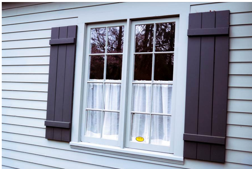
Figure 6: Detail of a multilight casement on the west facade. March 2014