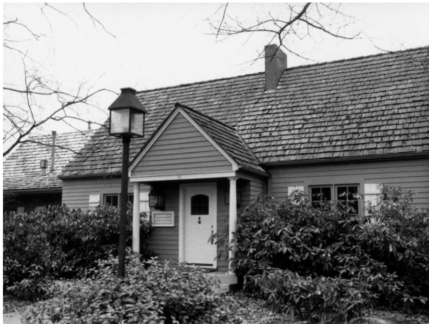
Date unknown, but likely taken in 1989 as part of the Cultural Resource Inventory. Photo ID: HRAB24