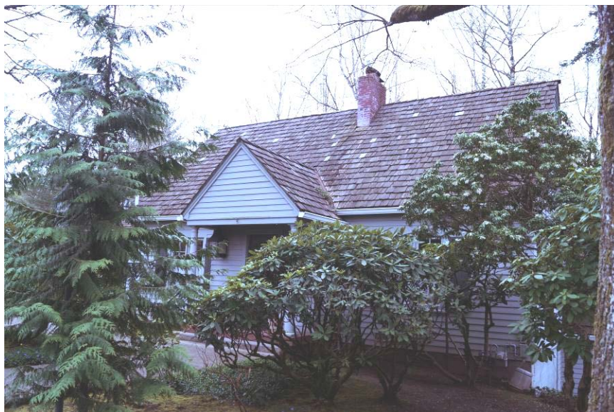
Figure 4: Looking east at the west façade. March 2014