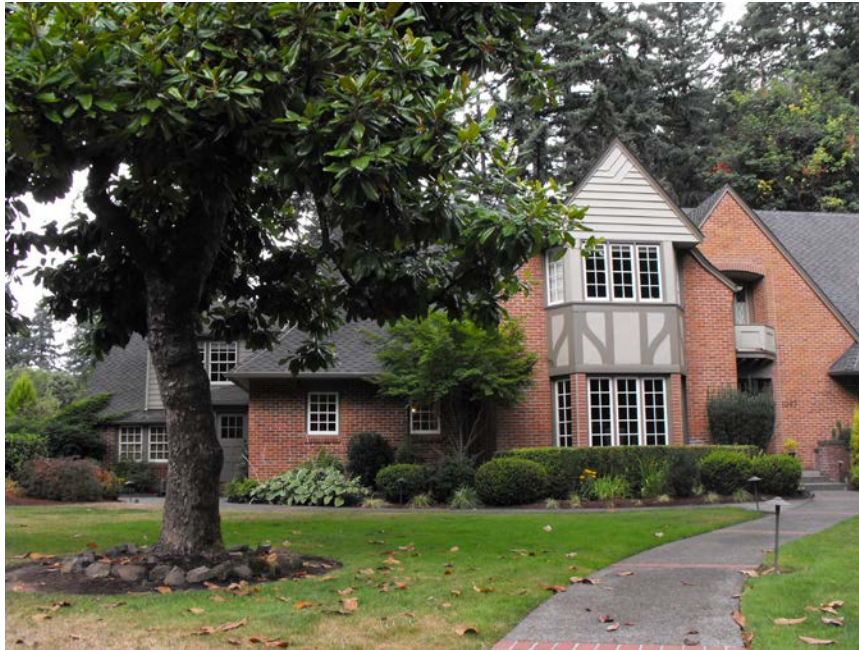
Figure 7. Looking north at the south façade. August 2014.