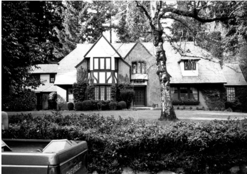
Figure 3. Looking north at the south façade. No date. Photo ID: HRAB77