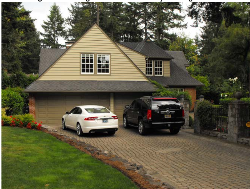
Figure 8. Looking east at the west façade. August 2014.