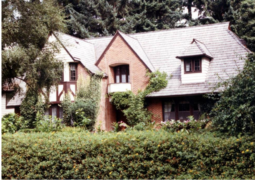
Figure 5. Looking north at the south façade. No date. Photo ID: HRAB79