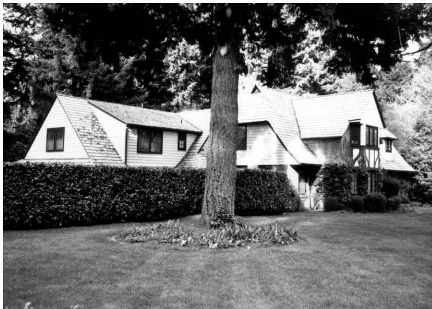
Figure 4. Looking northeast at the west and south façade. No date. Photo ID: HRAB78