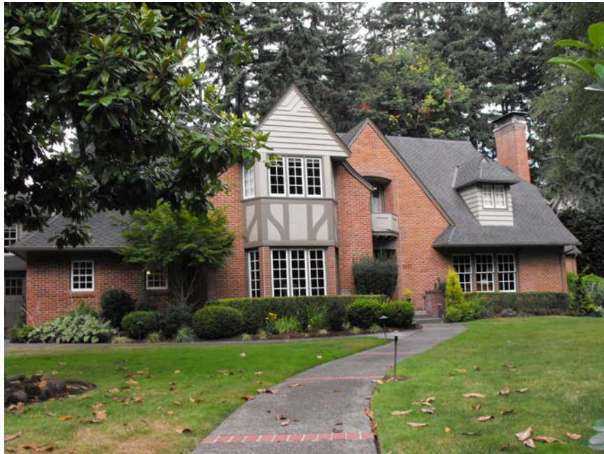
Figure 6. Looking north at the south façade. August 2014.