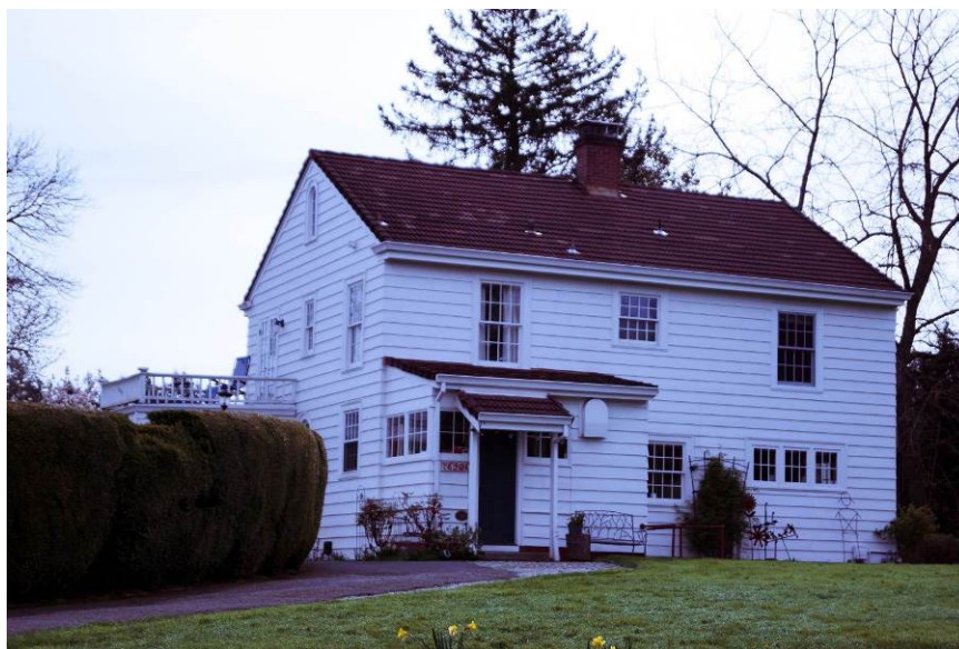
Figure 4: Looking southeast at the north and west façades. March 2014