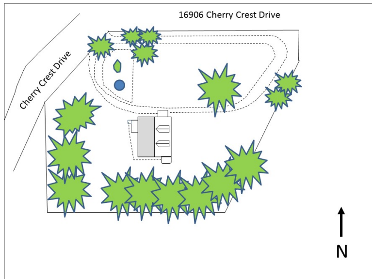
Figure 2. Site plan