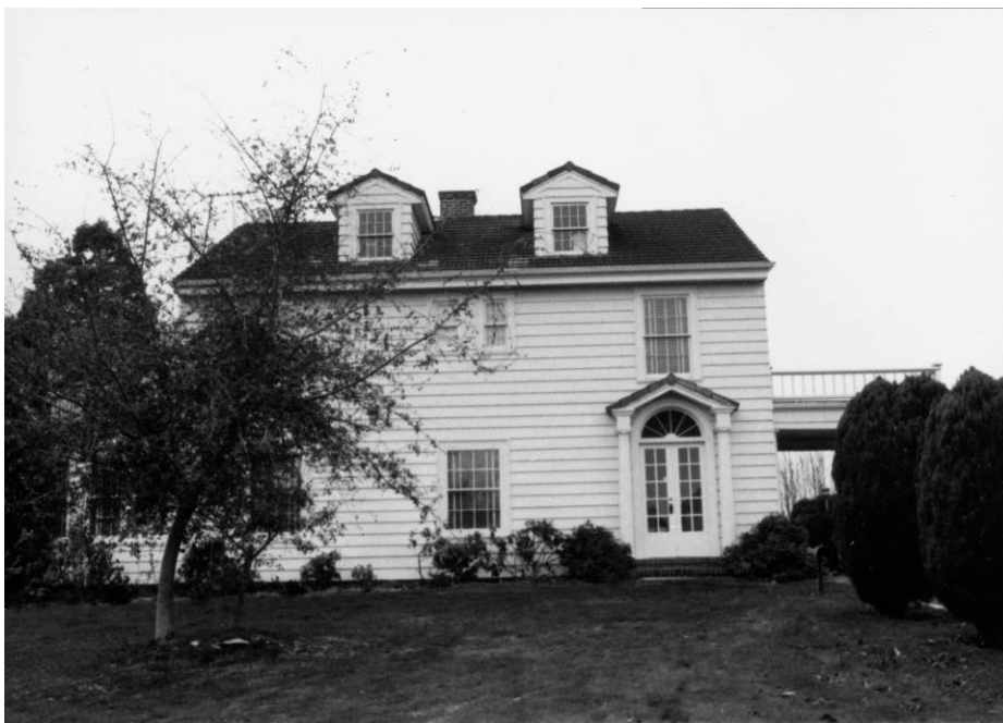
Figure 3: Looking west at the east façade. Date unknown, but likely taken for the 1989 Cultural Resource Inventory. Photo ID: HRAB93