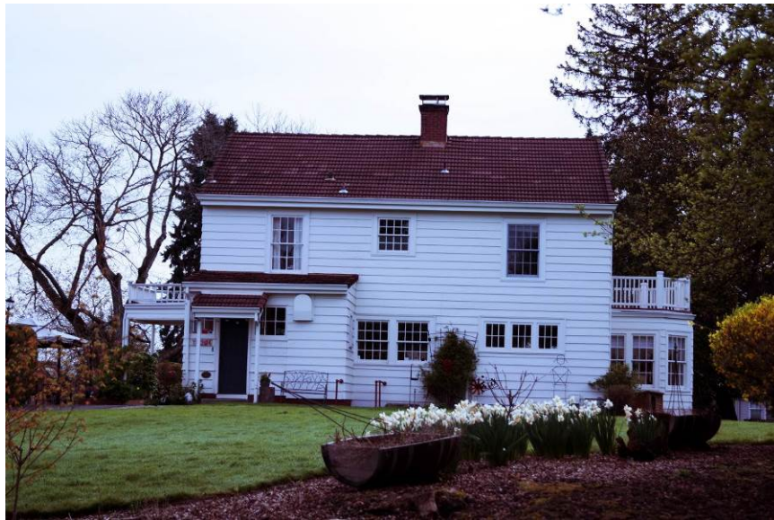
Figure 5: Looking east at the west façade. March 2014