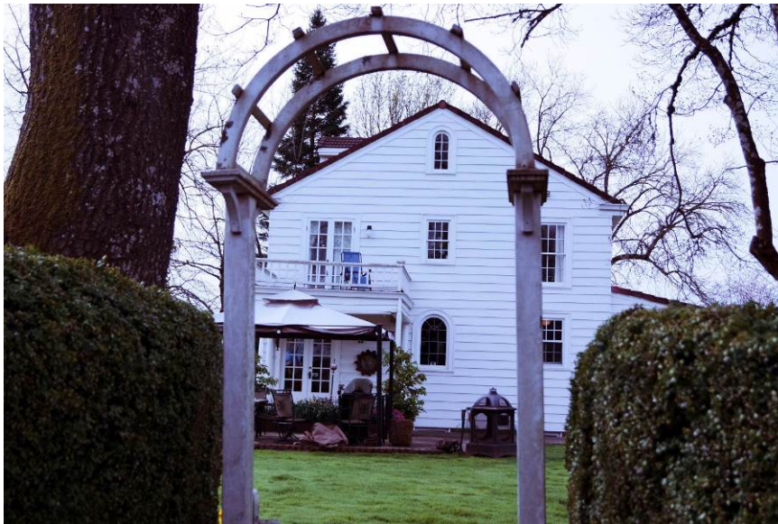
Figure 6: Looking south at the north façade. March 2014