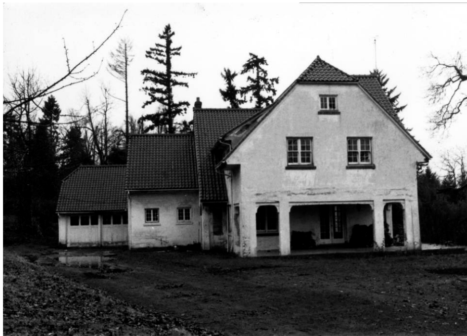
Figure 4. Looking north at the south façade. No date. Photo ID:HRAB89