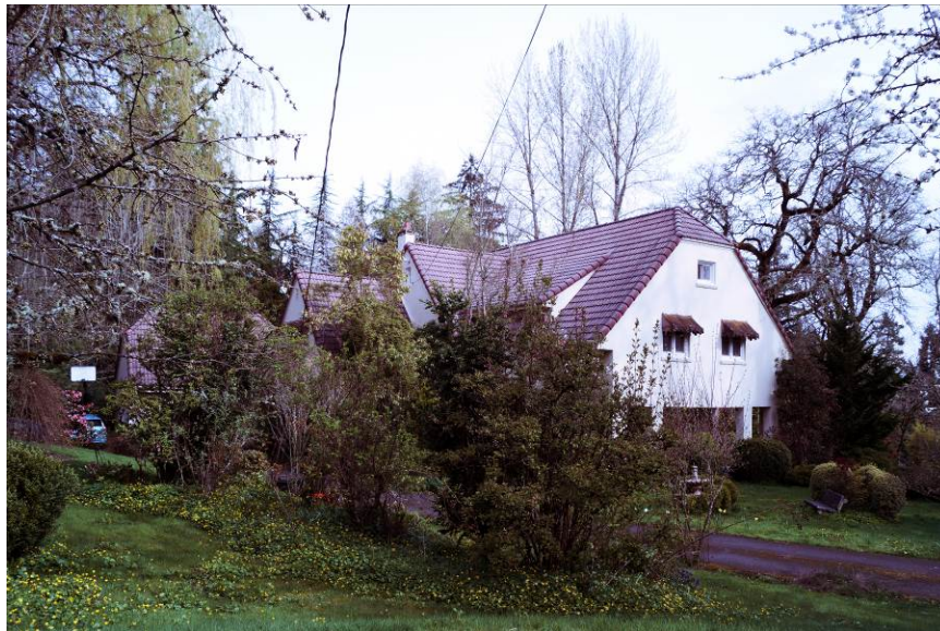
Figure 8. Looking north at the south and west façades. March 2014.