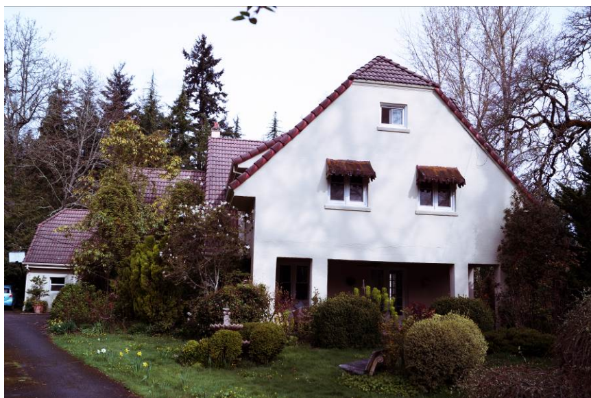
Figure 6. Looking north at the south façade. March 2014.