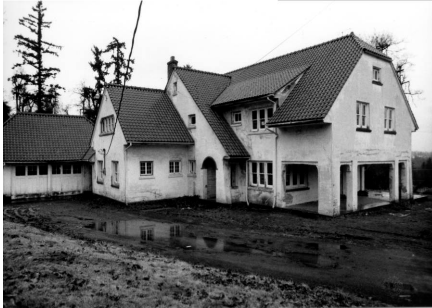
Figure 3. Looking north at the south and west façades. No date. Photo ID:HRAB88