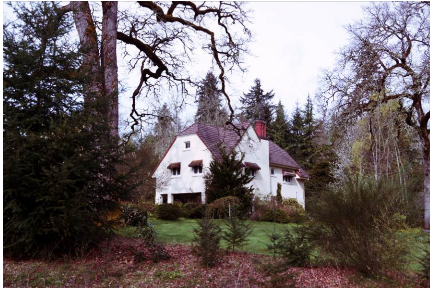
Figure 7. Looking northwest at the south and east façades. March 2014.