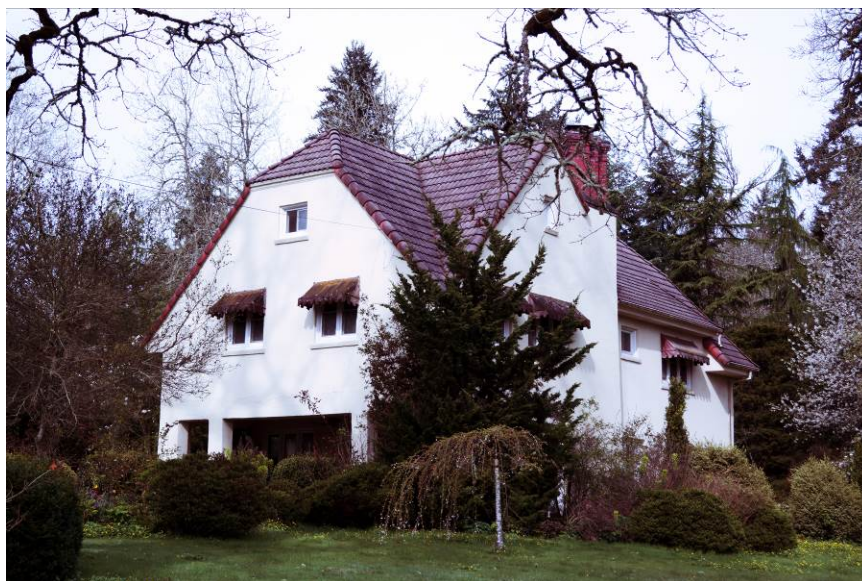
Figure 5. Looking northwest at the south and east façades. March 2014.