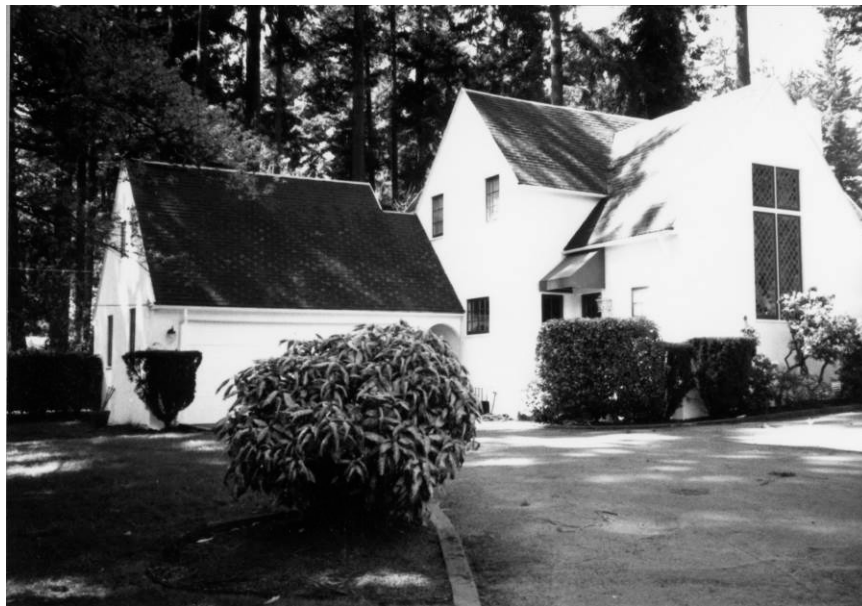
Figure 4: Looking northwest at the east and south façades. Date unknown, but likely taken for the 1989 Cultural Resources Inventory. Photo ID: HRAB95