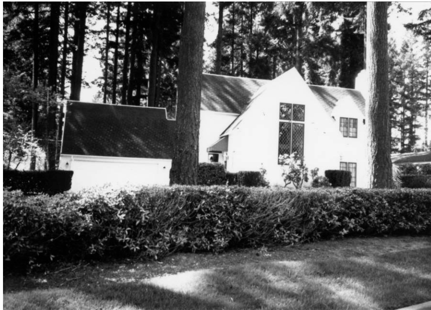
Figure 3: Looking west at the east façade. Date unknown, but likely taken for the 1989 Cultural Resources Inventory. Photo ID: HRAB94