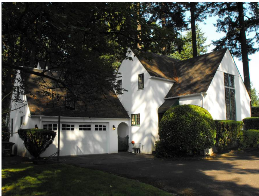
Figure 7: Looking northwest at the east and south façades.

Street Address: 432 Country Club Situs Address