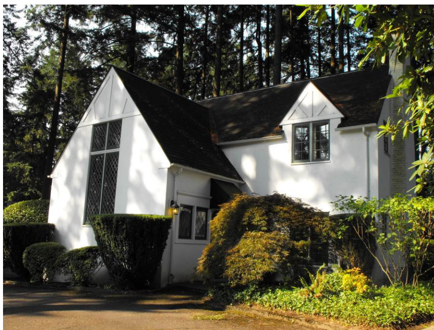
Figure 6: Looking southwest at the east façade. Date unknown, but likely taken for the 1989 Cultural Resources Inventory. Photo ID: HRAB95