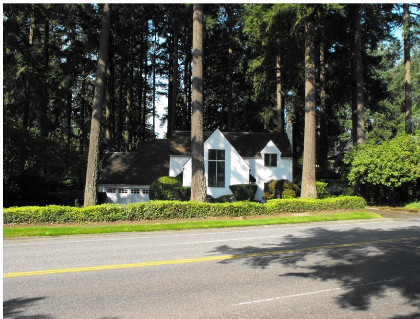
Figure 5: Looking west at the east façade. August 2014