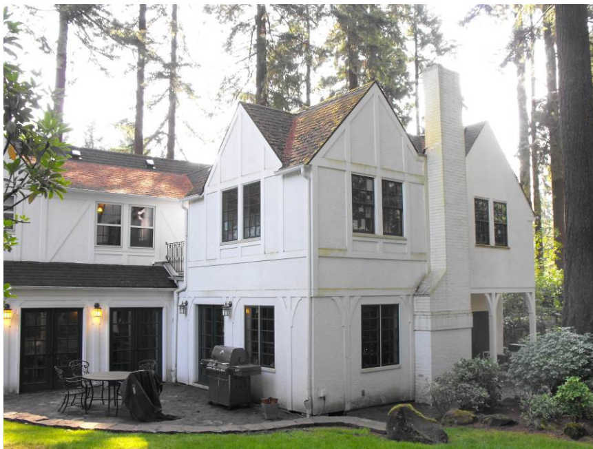
Figure 8: Looking southeast at the west façade.

*Researcher/ Organization: L. Radwanski/E. Heideman/A. Boyd/ SWCA-1220 SW Morrison St, Portland, OR 97205 City of Lake Oswego, 380 "A" Avenue, Lake Oswego, OR 97034 Additional research and review by Erin O'Rourke-Meadors