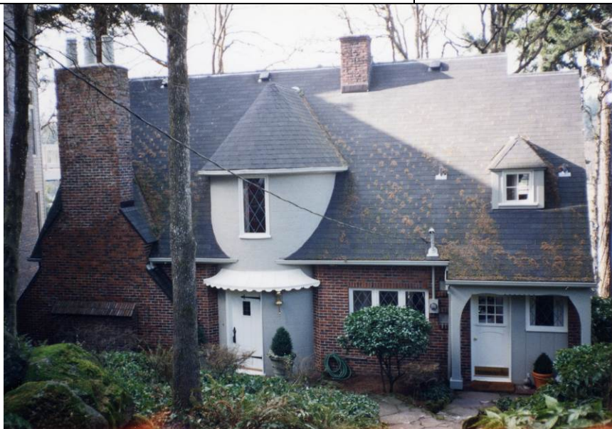
Figure 3. Looking west at the east façade. 2006 Photo ID: HRAB124