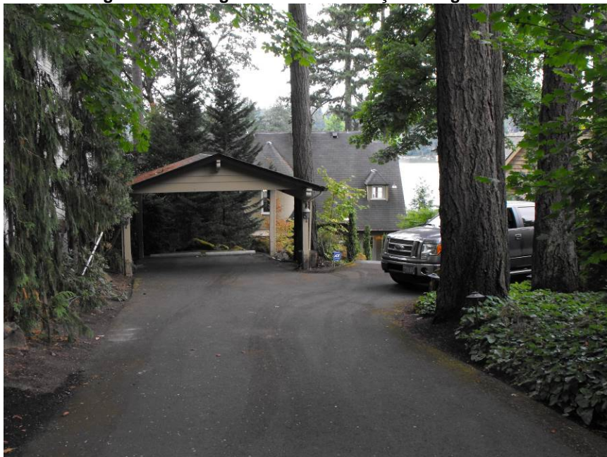
Figure 7. Looking west at the east façade down driveway, carport in foreground. August 2014