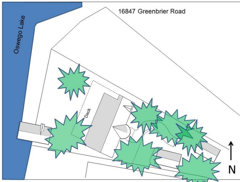
Figure 2. Site plan, provided by the City of Lake Oswego