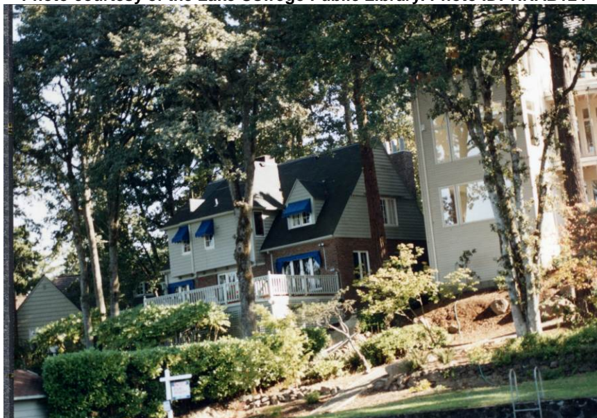
Figure 4. Looking northeast at the west and south façades. 2006 Photo ID: HRAB544