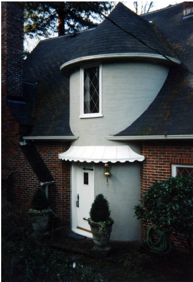
Figure 5. Looking west at the east façade. 2006. Photo ID: HRAB127