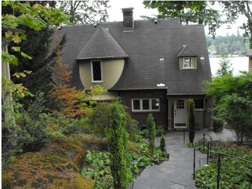
Figure 6. Looking west at the east façade. August 2014