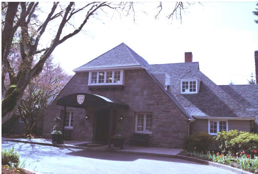
Figure 7. Looking south at the north façade. March 2014.