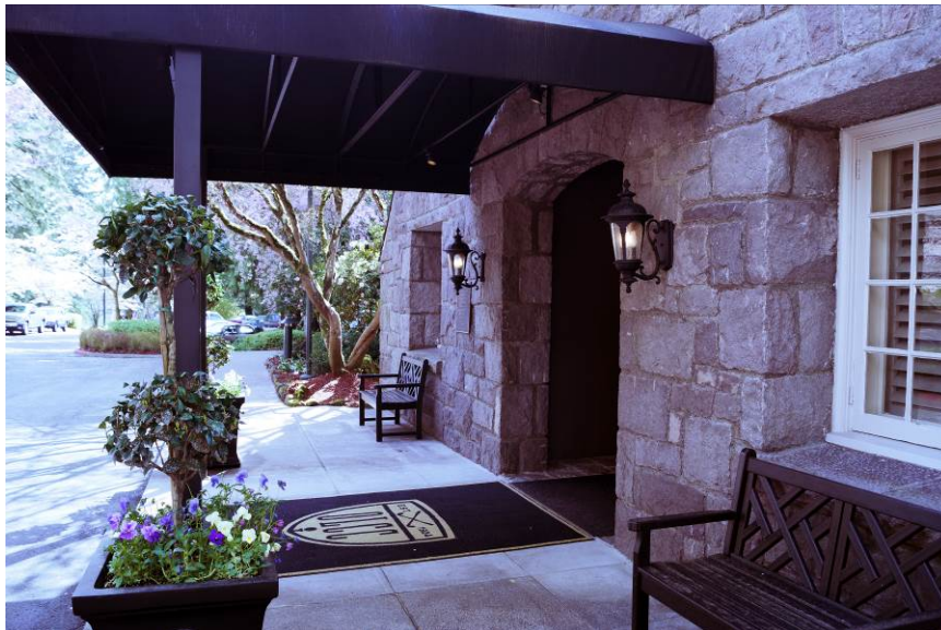
Figure 6. Detail of rockwork and front entrance. March 2014