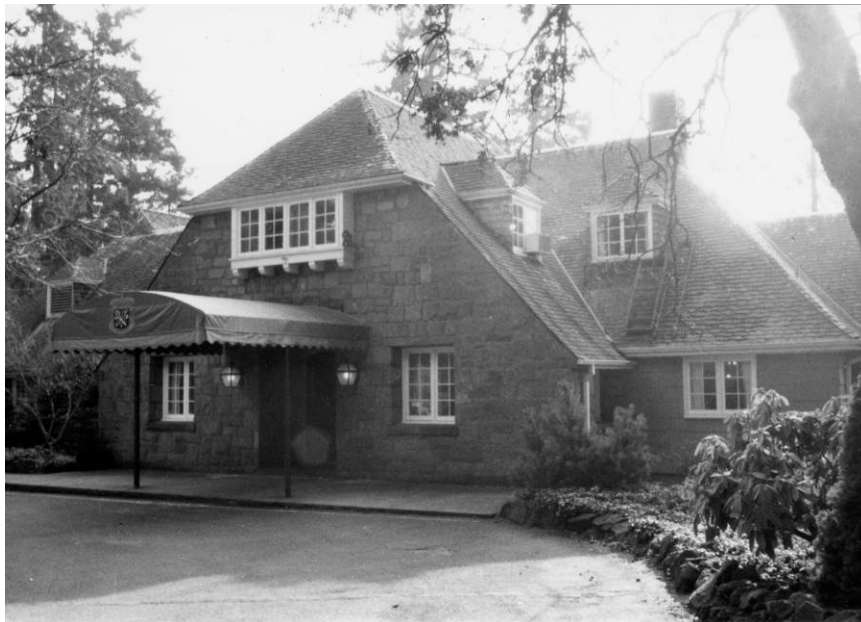
Figure 3. Looking south at the north façade. Unknown date. Photo ID: HRAB155