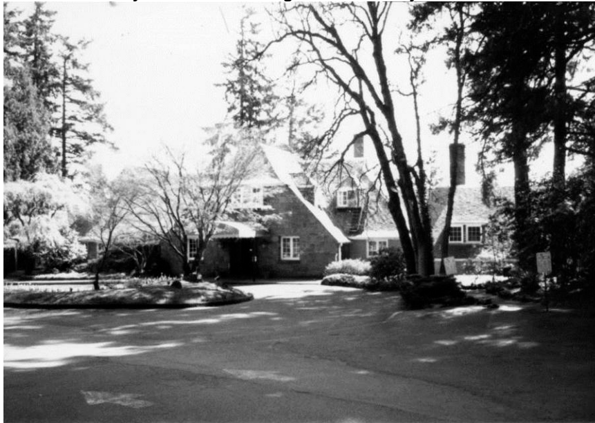
Figure 4. Looking south at the north façade. Unknown date. Photo ID: HRAB107