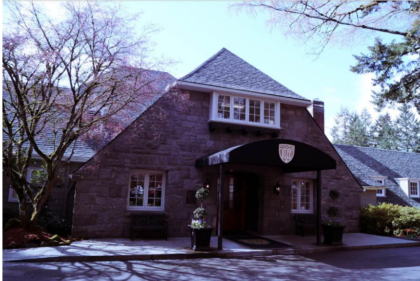
Figure 5. Looking southeast at the north façade. March 2014.