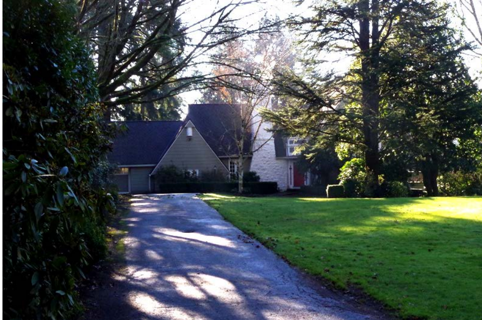
North Façade (Viewing South)