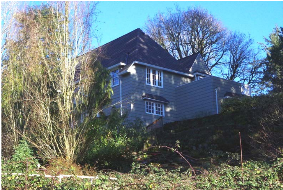
South Façade (Viewing Northeast)