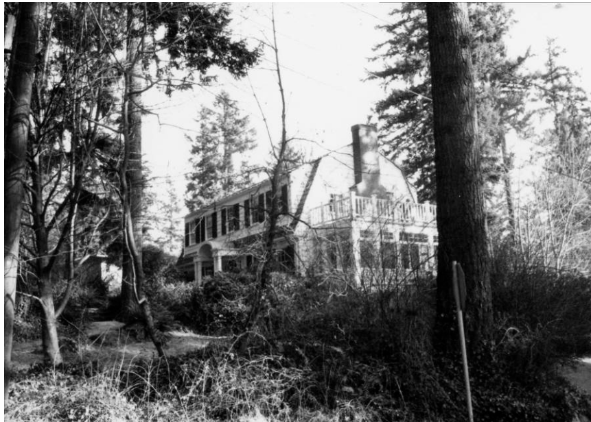
Figure 4. Looking northeast at the northeast and southwest façade. Date unknown. Photo ID:HRAB158