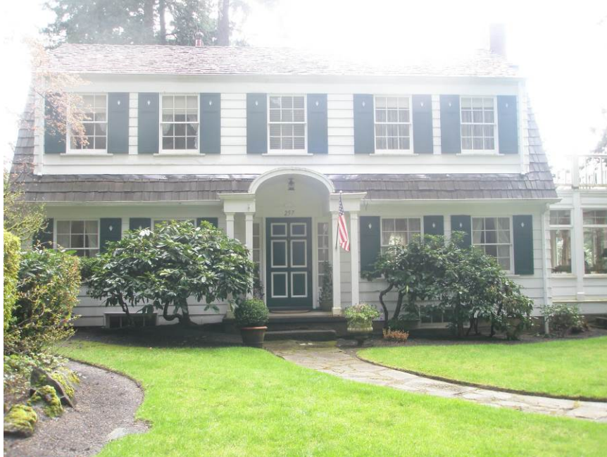
Figure 5. Looking southeast at the northwest façade. 2011.