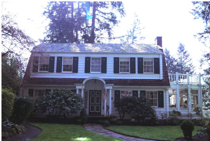
Figure 6. Looking southeast at the northwest façade. March 2014.