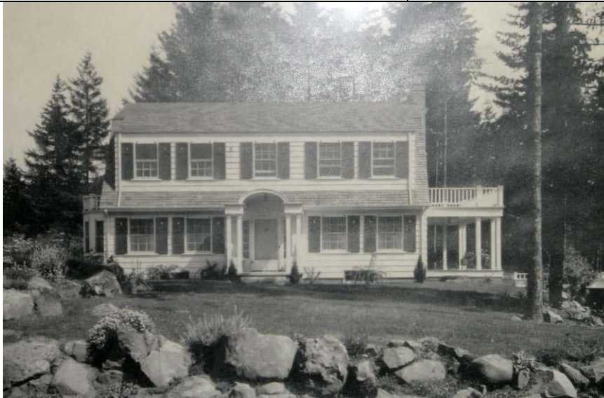
Figure 3: Historic photo. Photo taken at property owners home, date unknown