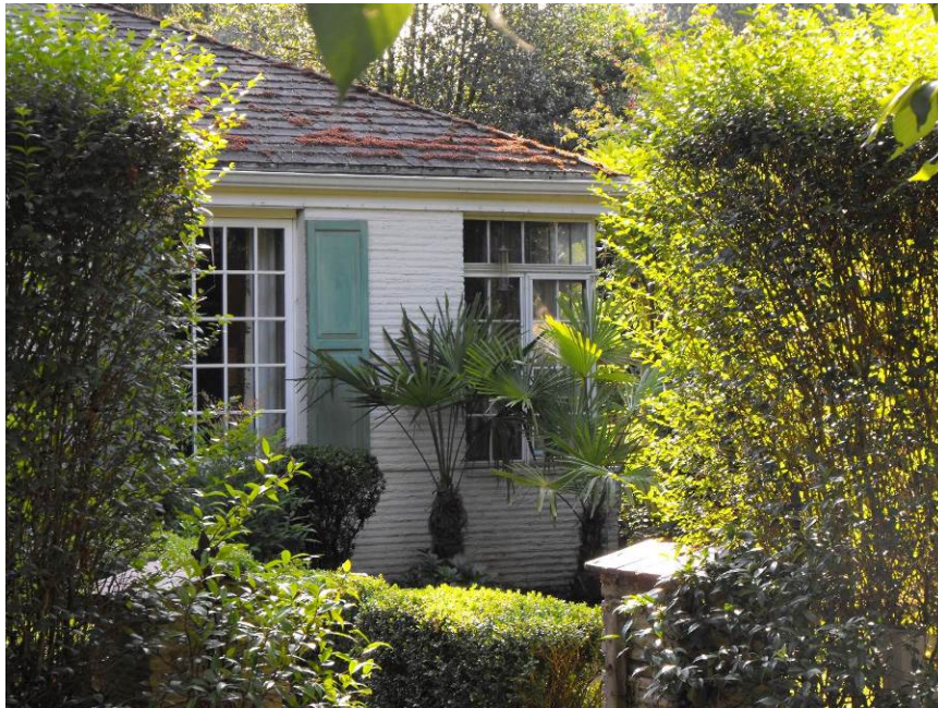
Figure 6. Looking southeast at the west façade. March 2014