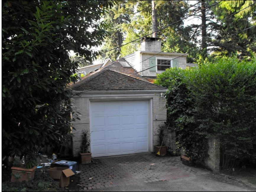
Figure 7. Looking south at the north façade of garage. March 2014