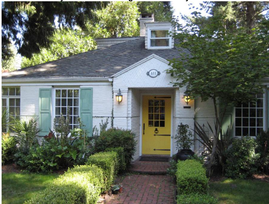
Figure 4. Looking east at the west façade. 2008 Photo ID IMG_1748_20080910_0936