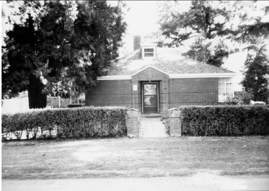
Figure 3. Looking east at the west façade. Date unknown. This was the photo used in the 1989 survey, suggesting it was from that period. Photo ID: HRAB273