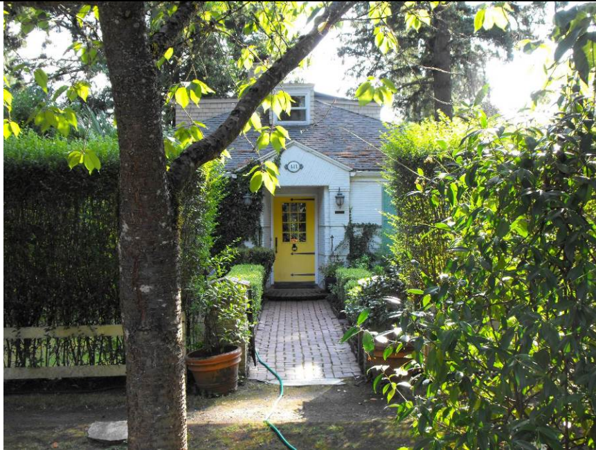
Figure 5. Looking east at the west façade. March 2014