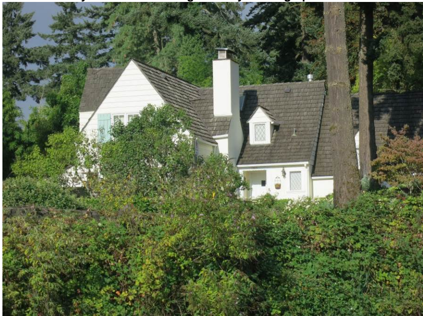
Figure 6: Looking west at the east façade. 2013