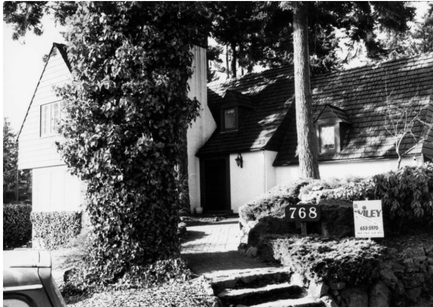
Figure 3: Looking southwest at the North façade. Photograph ID HRAB200. Date unrecorded, but used during the 1989 Cultural Resources Inventory