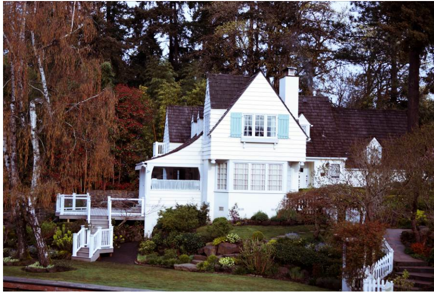
Figure 7. Looking west at the east façade. March 2012.

Street Address: 768 North Shore Road Situs Address