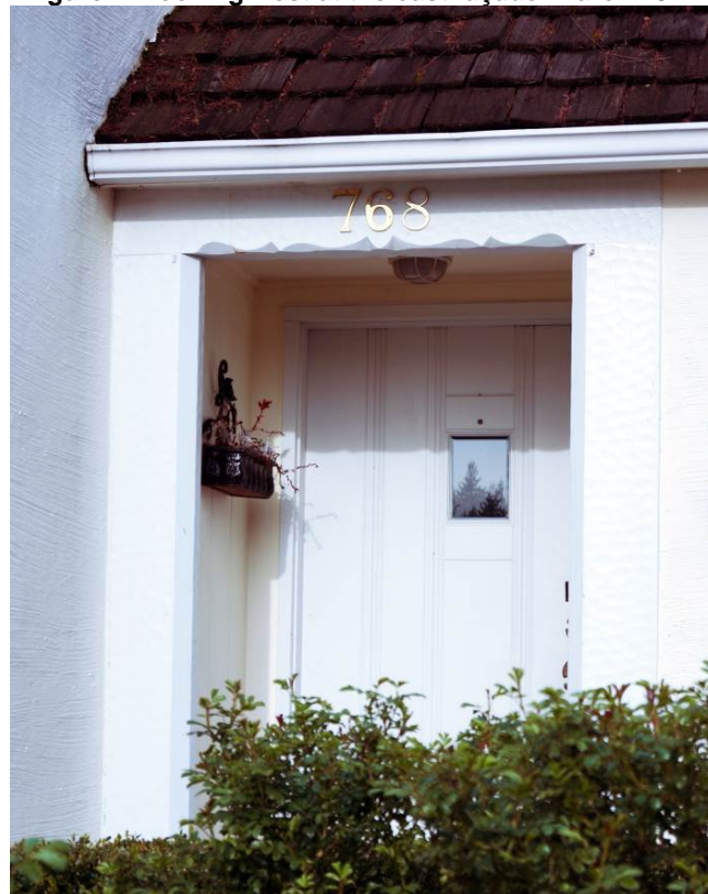
Figure 8. Looking south at the front entrance detail. March 2014.

*Researcher/ Organization: L. Radwanski/E. Heideman/A. Boyd/ SWCA-1220 SW Morrison St, Portland, OR 97205 City of Lake Oswego, 380 "A" Avenue, Lake Oswego, OR 97034 Additional research and review by Erin O'Rourke-Meadors