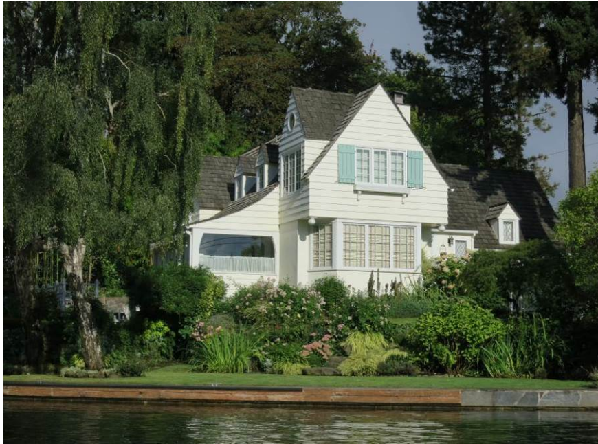
Figure 5: Looking west at the east façade. 2013