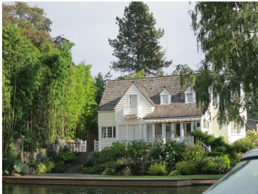
Figure 4: Looking north at the south façade. 2013.