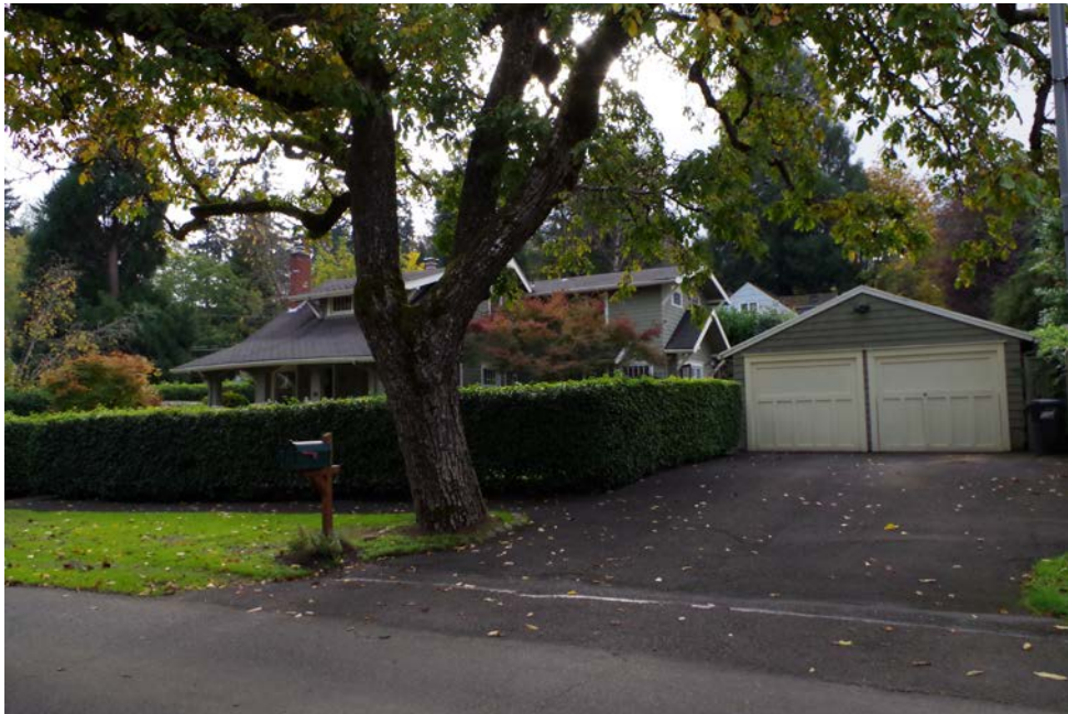
North Façade and Garage (Viewing Southeast)