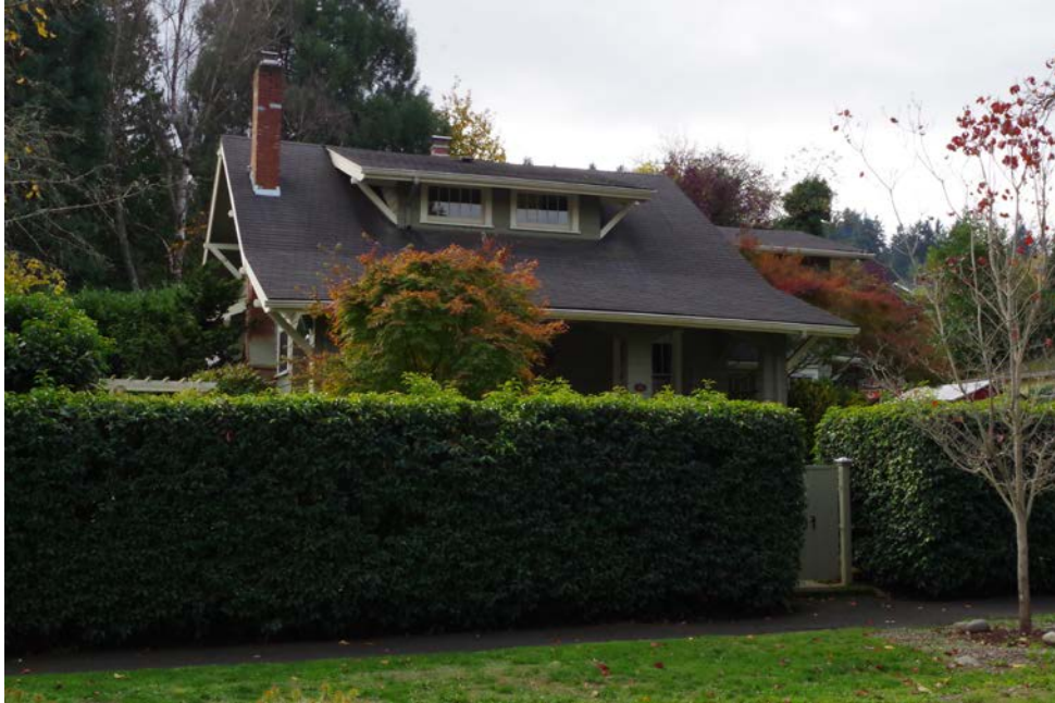
North Façade (Viewing Southwest)