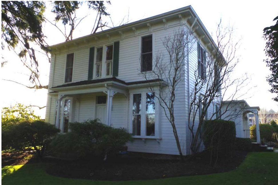
East Façade (Viewing Southwest)