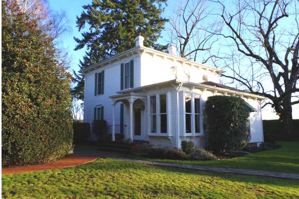
West Façade (Viewing Southeast)