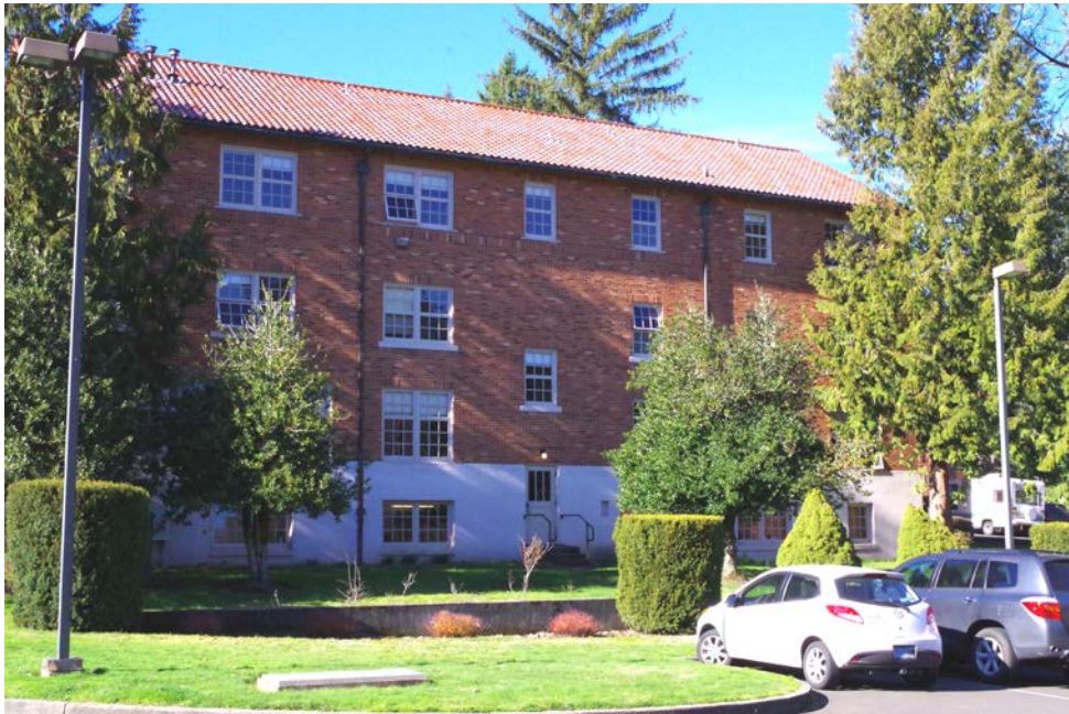
East Façade (Viewing Northwest)