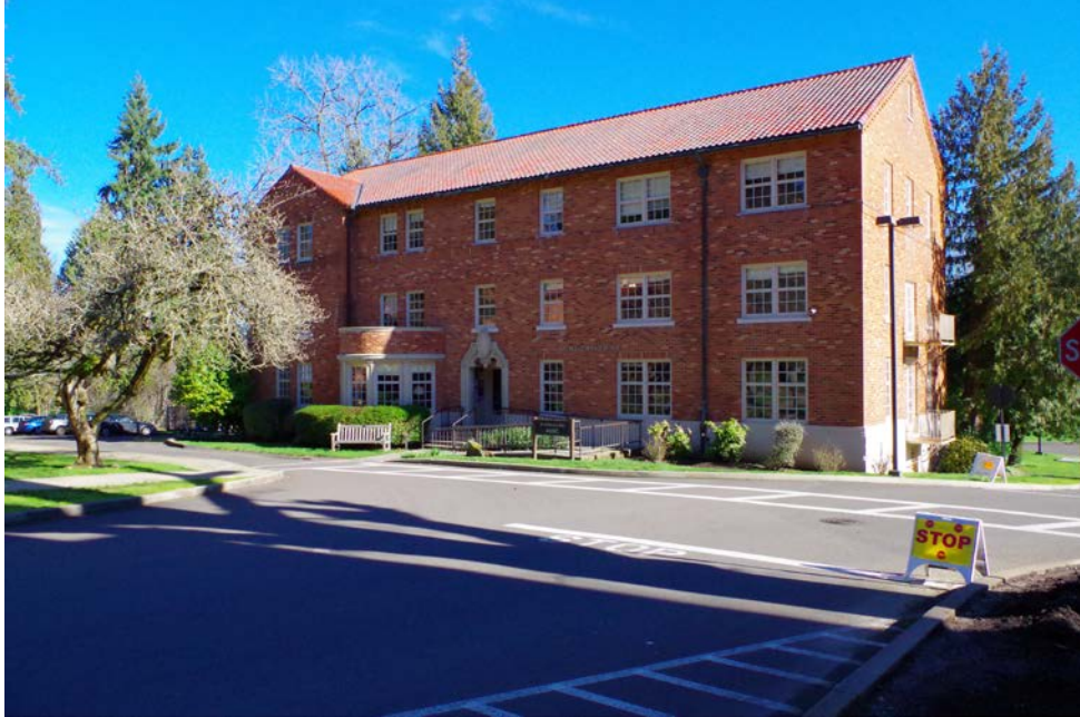
West Façade (Viewing Northeast)