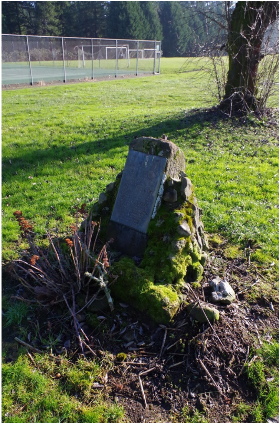
Bryant Homesite Marker (Viewing Southeast)