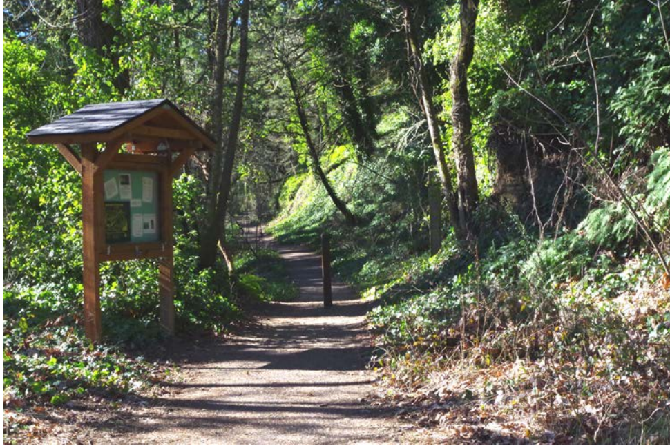
Trailhead (Viewing West)