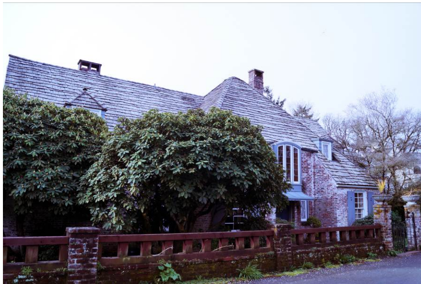
Figure 4. Looking southwest at the north façade. March 2014.

Date stated as unknown, but it is the same photo used during the 1989 cultural resource inventory Photo ID: HRAB305