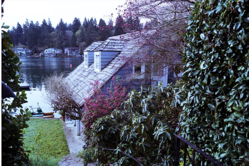
Figure 7. Looking south, east side of boat house visible. March 2014.

*Researcher/ Organization: L. Radwanski/E. Heideman/A. Boyd/ SWCA-1220 SW Morrison St, Portland, OR 97205 City of Lake Oswego, 380 "A" Avenue, Lake Oswego, OR 97034 Additional research and review by Erin O'Rourke-Meadors