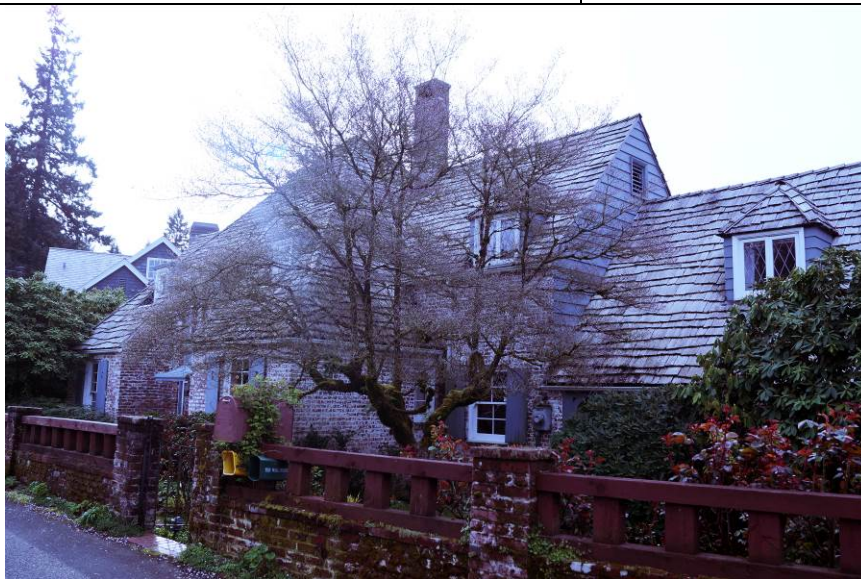
Figure 5. Looking southeast at the north façade. March 2014.