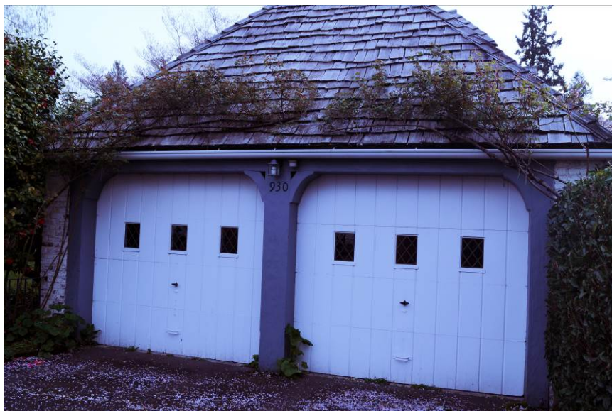
Figure 6. Looking east at the west façade of garage. March 2014.