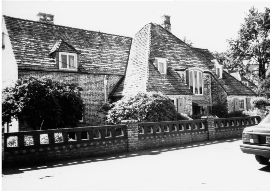
Figure 3. Looking southwest at the north façade..

Date stated as unknown, but it is the same photo used during the 1989 cultural resource inventory Photo ID: HRAB305