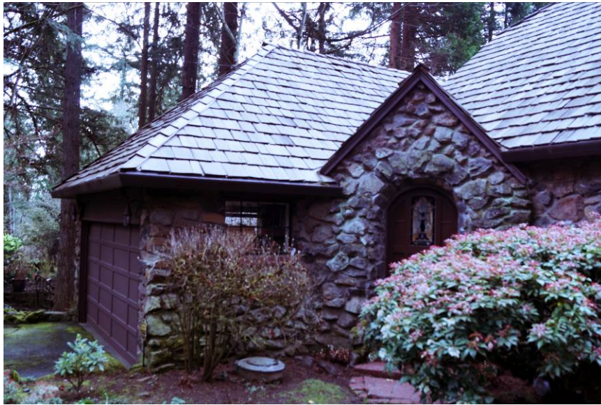
Figure 6. Secondary door to garage, looking southeast at the north façade. March 2014.