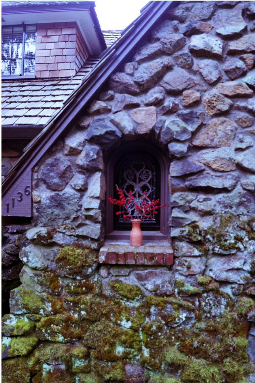
Figure 5. Detail of the front entrance stonework looking south at the north façade. March 2014.