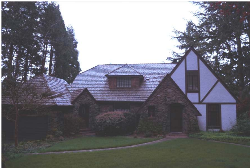
Figure 4. Looking south at the north façade. March 2014.