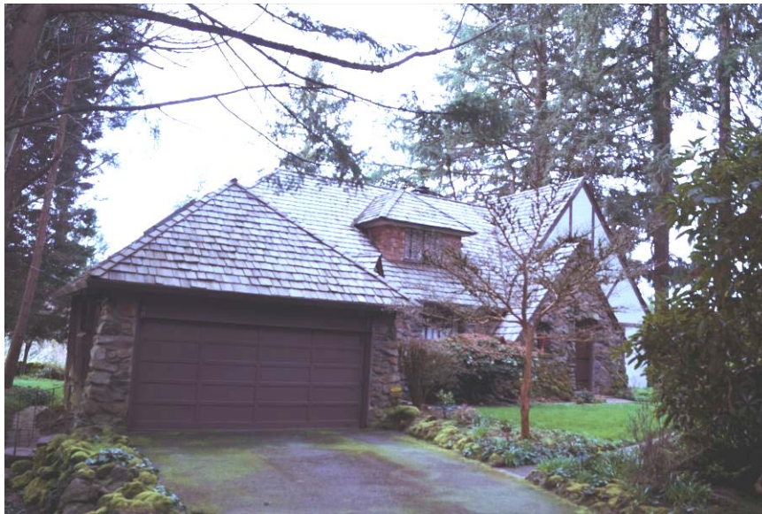
Figure 3. Looking south at the north façade. March 2014.