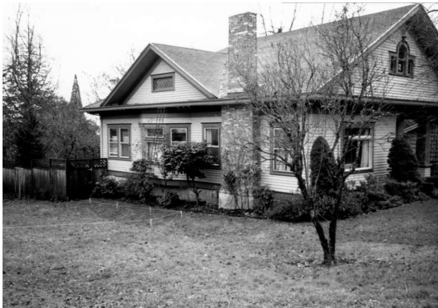
Figure 3. Looking southeast at the north and west façades. Date unknown. Photo ID: HRAB390