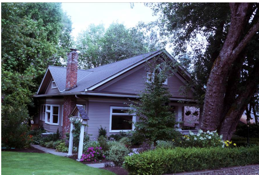
Figure 4. Looking southeast at the north and west façades. March 2014.