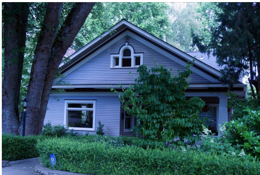
Figure 5. Looking east at the west façade. March 2014 Photo ID: HRAB390