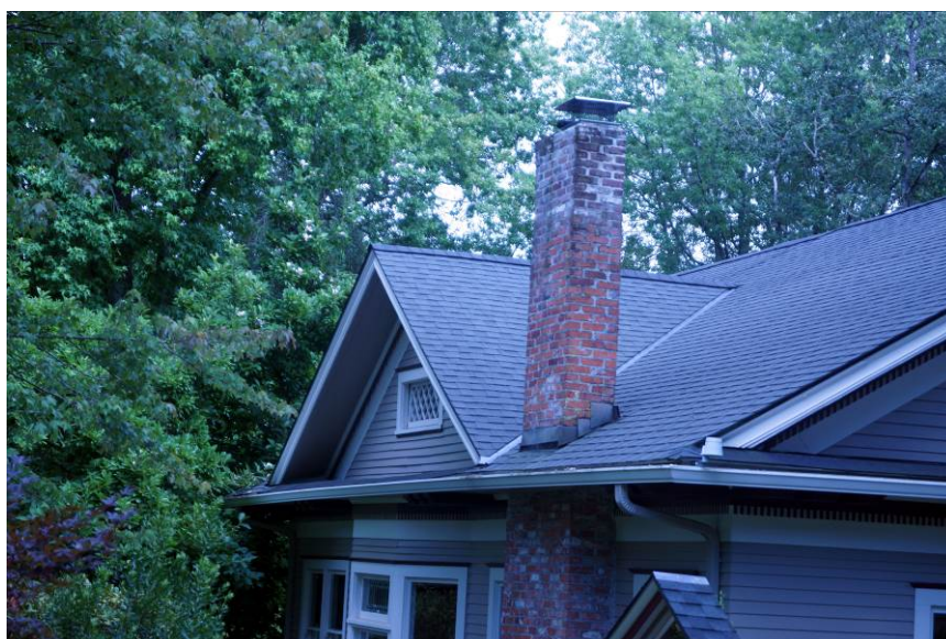
Figure 6. Detail of chimney and wall gable with lattice window. March 2014.